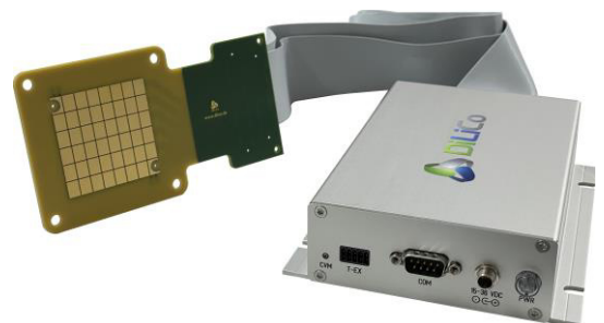
sensor layer with evaluation electronics